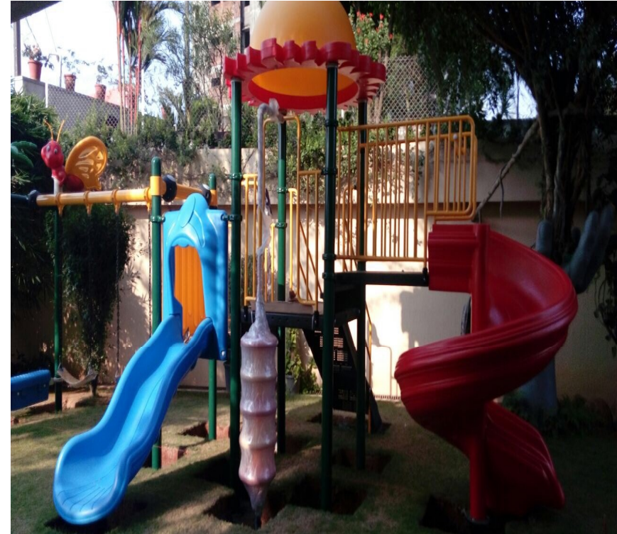
VEEGALAND GREEN CLOUDS, KOCHI