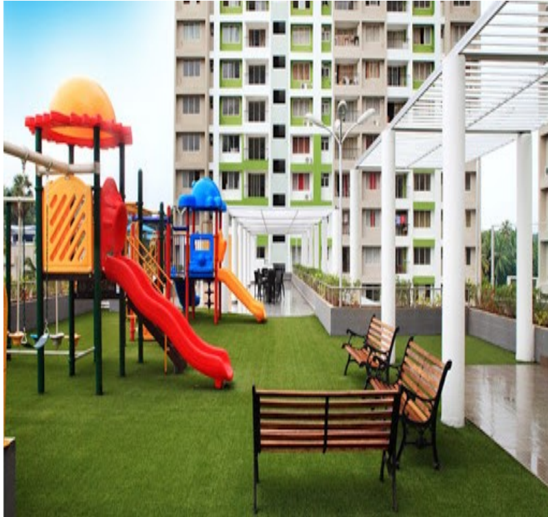
SFS CYBERPALMS, TRIVANDRUM